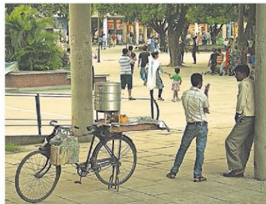
People socialise in Sector 17 of Chandigarh