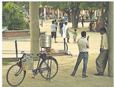
People socialise in Sector 17 of Chandigarh