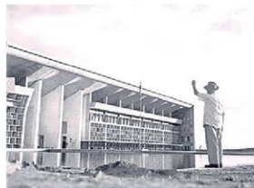
Le Corbusier at the High Court, 1955

Nehru said it should “be a new town, symbolic of the freedom of India, unfettered by the past”