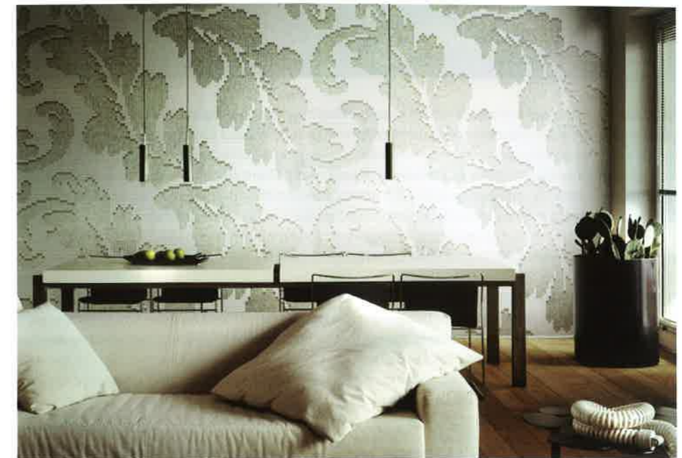
Ardassa, Bisazza glass mosaic pattern, 20x20 mm tiles. Design Tricia Guild. Available in Emerald and Ivory versions.

For more information, visit www.bisazza.com .