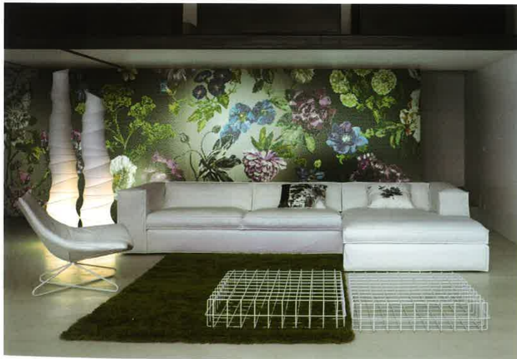
Left: Alexandria, Bisazza glass mosaic pattern, 10x10 mm tiles. Design Tricia Guild.

In the 'Charlottenberg One' pattern, the same floral motif is re-proposed as the single decorative element against a solid colour background, heralding a new means of personalising one's interior spaces.