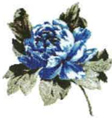
Charlottenberg One, Bisazza glass mosaic pattern, 10x10 mm tiles. Design Tricia Guild.

'Charlottenberg' is also botanically-inspired. Here, a series of eloquent peonies, interpreted in unique shades of blue and grey, unfold against a white background. A production that reveals its contemporary spirit in the bold dimensions and colour choices of the designs, while maintaining its romantic appeal.