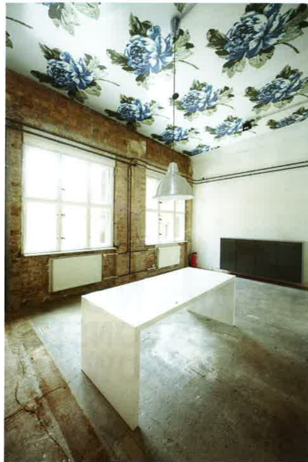
Above: Charlottenberg, Bisazza glass mosaic pattern, 10x10 mm tiles. Design Tricia Guild.